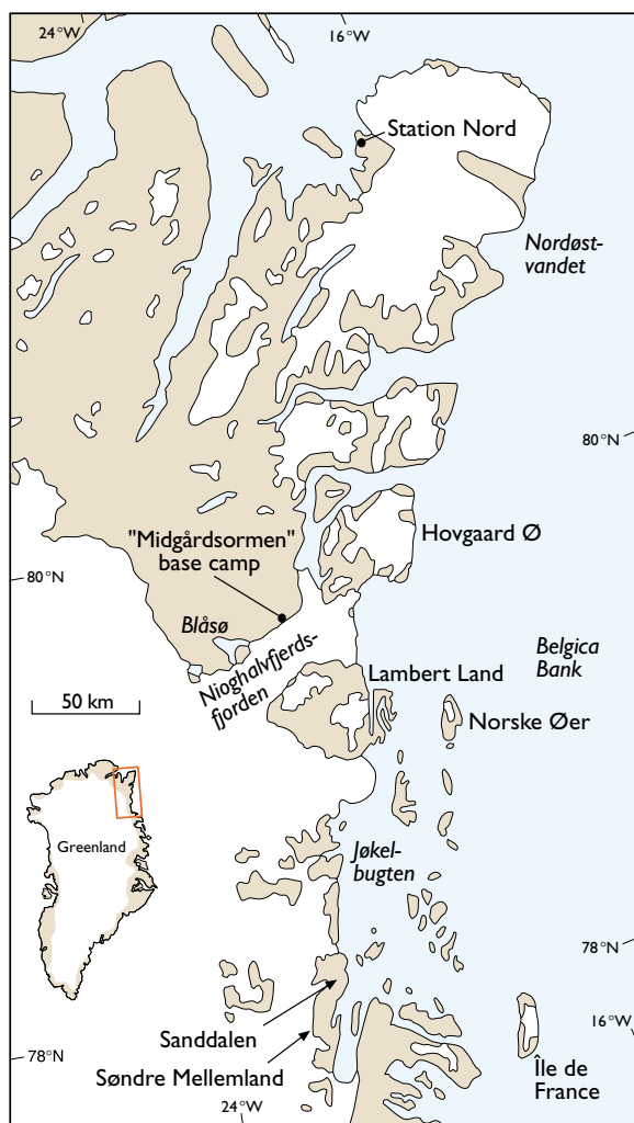
Fig. 1. Map of northern North-East and eastern North Greenland showing localities mentioned in the text.

In North and North-East Greenland, several of the outlet glaciers from the Inland Ice have long, floating tongues (Higgins 1991). Nioghalvfjærdsfjorden (Fig. 1)