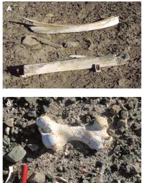
Fig. 3. A: Fragments of two ribs of a whale, probably Greenland right whale ( Balaena mysticetus ), found on raised beaches. Matchbox for scale. B: Thigh bone of a seal, probably ringed seal ( Pusa hispida ), and shells of Mya truncata , found on raised marine deposits. Pencil for scale. Both found near Blåsø in the inner part of Nioghalvfjærdsfjorden.

After deglaciation, molluscs and marine mammals were able to live in Nioghalvfjærdsfjorden, and driftwood could enter the fjord. Twenty shell samples, nine samples of driftwood, five bones of seals and bone of a whale, collected on raised beaches, on raised marine deposits and along the shore of Blåsø, have been dated (Figs 2, 3); these yielded ages between c. 7.7 ka BP and 4.5 ka BP. The distribution of dates shows that the fjord was not glaciated during this period in the middle