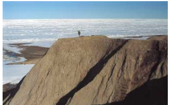
Fig. 4. General views of exposures of Pliocene sediments near the northern tip of Île de France. Height of sections around 40 m, with the top c. 80 m above sea level.