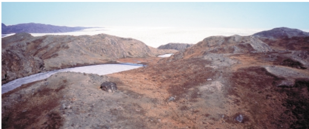
Fig. 4. The region along the ice margin (as here north-west of Kangerlussuaq) is strongly affected by the radiative differences of the glacier and the adjacent tundra (Duynderke & van den Broeke 1994), which may influence processes that affect mercury accumulation and retention in lakes in this region. Air temperatures above the surface of the Inland Ice in the background of the photograph are just above freezing in the summer, whereas temperatures above the adjacent tundra (foreground) may reach 15°C. It is this temperature gradient that periodically gives rise to strong katabatic winds flowing from east (the ice) to west (the land). As described in the text, these strong environmental (temperature, radiation) gradients from ice to land may influence mercury accumulation and retention in the lakes on the tundra. The lake in the middle foreground is c. 250 m across.

ses of some sediments, particularly from the lakes with laminated sediments and high-water conductivities, have been complicated by the high sulphur contents which necessitated pre-treatments. Additional improvements in these procedures have contributed to a lowering of the detection limit for persistent organic pollutants in sediment samples and reductions in sample size, which permits better temporal resolution in sediment cores. Assessment of analyses of the samples collected in May 2000 are in progress, which includes estimations of accumulation rates and cumulative inventories of PCBs and polybrominated diphenyl ethers (PBDEs), a class of widely used flame retardants. The results of the sampling in Greenland in May 2000 will be compared with those of a similar project using lake sediment cores taken in the northern Swedish mountains.