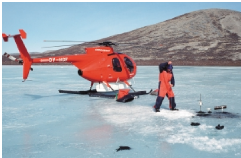
Fig. 3. Sampling at Lake H in May 2000. The lake is at c. 150 m a.s.l., well below the snowline.

area (Lakes A–H on Fig. 1; \sim 67^{\circ}10'N , 57^{\circ}30'W ) constituted a 35 km long transect of eight lakes along an elevation gradient from c. 150 m to 950 m above sea level. A second group of three lakes (a new core from Lake 21 and new Lakes J and K) were each located within a few km of the ice-sheet margin, east of Kangerlussuaq. One lake (Lake K, 67^{\circ}02.6'N , 50^{\circ}09.9'W ) is situated immediately above an ice tongue whose meltwater drains into the head of Søndre Strømfjord.