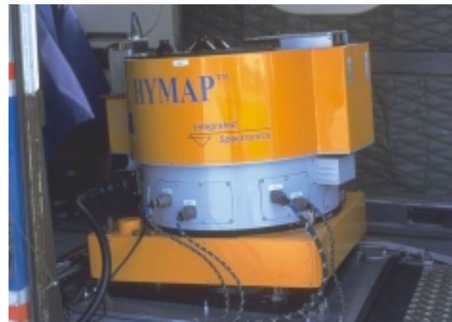
Fig. 1. HyMap™ imaging spectrometer installed on a Dornier 228 aircraft.

HyVista Corporation, Australia, was selected as the contractor for the airborne hyperspectral data acquisition. A Dornier 228 aircraft, operated by Deutsches Zentrum