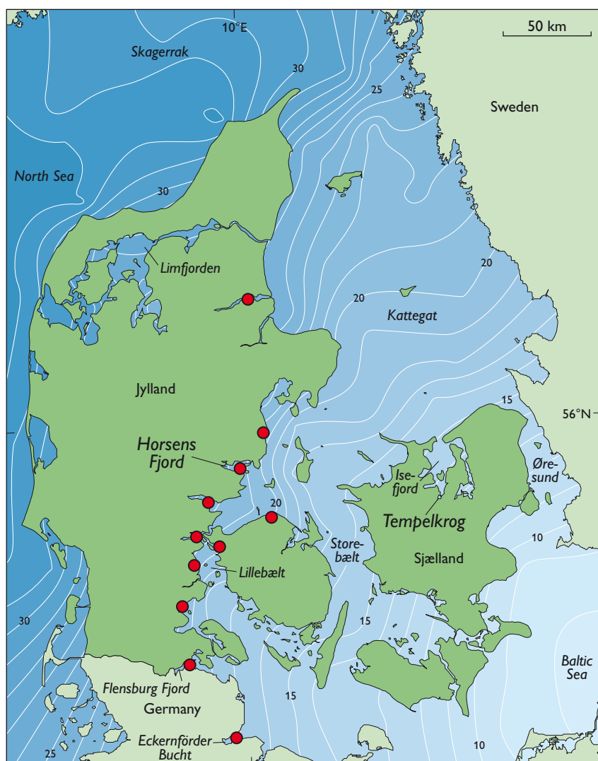
Fig. 1. Map of Denmark showing the location of the two study sites Horsens Fjord and Tempelkrog in Isefjord and the present day sea surface salinities (psu; annual mean) in the Danish waters. The red dots indicate fjords and estuaries with Iron Age shell middens. (modified from Dahl et al. 2003). Bælthavet includes Storebælt and Lillebælt and the sea between the islands south of Fyn and Sjælland.

The present-day circulation pattern in the inner Danish waters is dominated by a two-layer estuarine flow, driven by outflow of low-salinity surface water from the Baltic Sea and