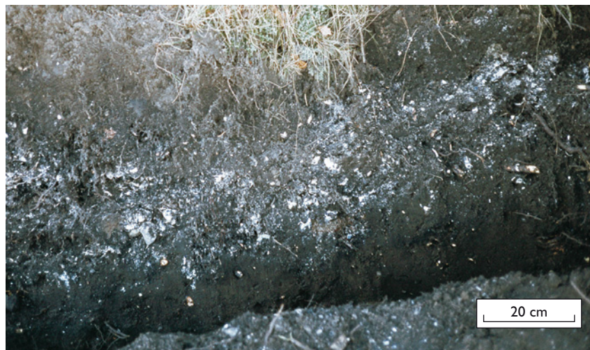
Fig. 3. Section of an Iron Age shell midden at Horsens Fjord. The Iron Age middens are mainly composed of shells, charcoal and pot boilers (stones used in cooking) and are interpreted as specialised coastal sites used for gathering and processing of shellfish (Poulsen 1978). Mollusc analysis from North German middens suggests that they are seasonal sites used in the late summer or autumn (Anger 1973).