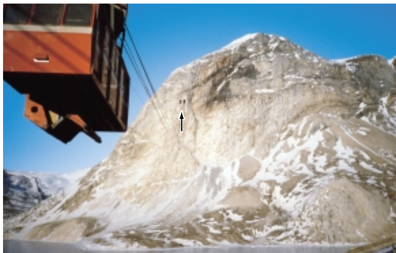
Fig. 53. Sorte Engel (Black Angel), the locality which hosted the Maarmorilik lead-zinc deposit at c. 71°N in central West Greenland. The two small black spots just beneath the left wing of the angel-like figure (marked by the arrow) are cable car entrances to the mine c. 500 m a.s.l.

was mined during the period 1924–1972. A total of about 570 000 tons of coal was shipped before the mine was closed because it was unprofitable (Schiener 1976). On nearby Nuussuaq, more than 180 million tons of sub-bituminous coal distributed in layers more than 0.8 m thick have been indicated by surface investigations and limited drilling (Shekhar et al. 1982).